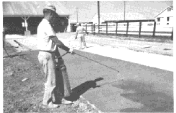
Application of liquid membrane-forming compound with hand sprayer.

a. Predictable strength gain. Laboratory tests show that concrete in a dry environment can lose as much as 50 percent of its potential strength compared to similar concrete that is moist cured. Concrete placed under high temperature conditions will gain early strength quickly but later strengths may be reduced.